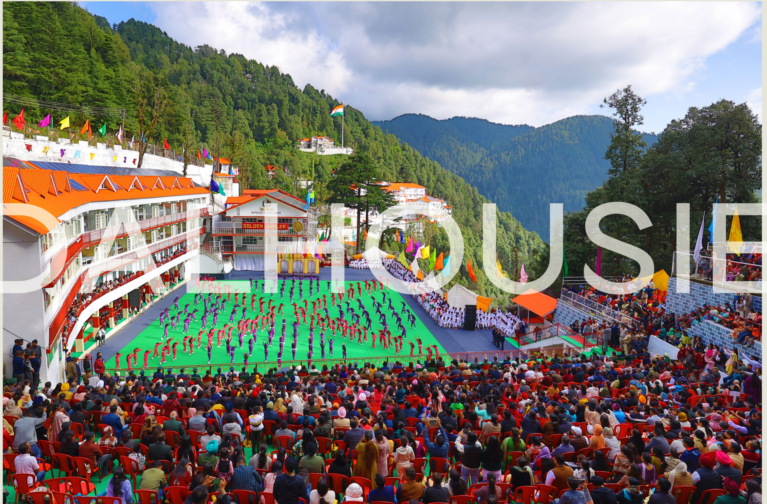
DALHOUSIE CAMPUS, 2100M ABOVE SEA LEVEL.